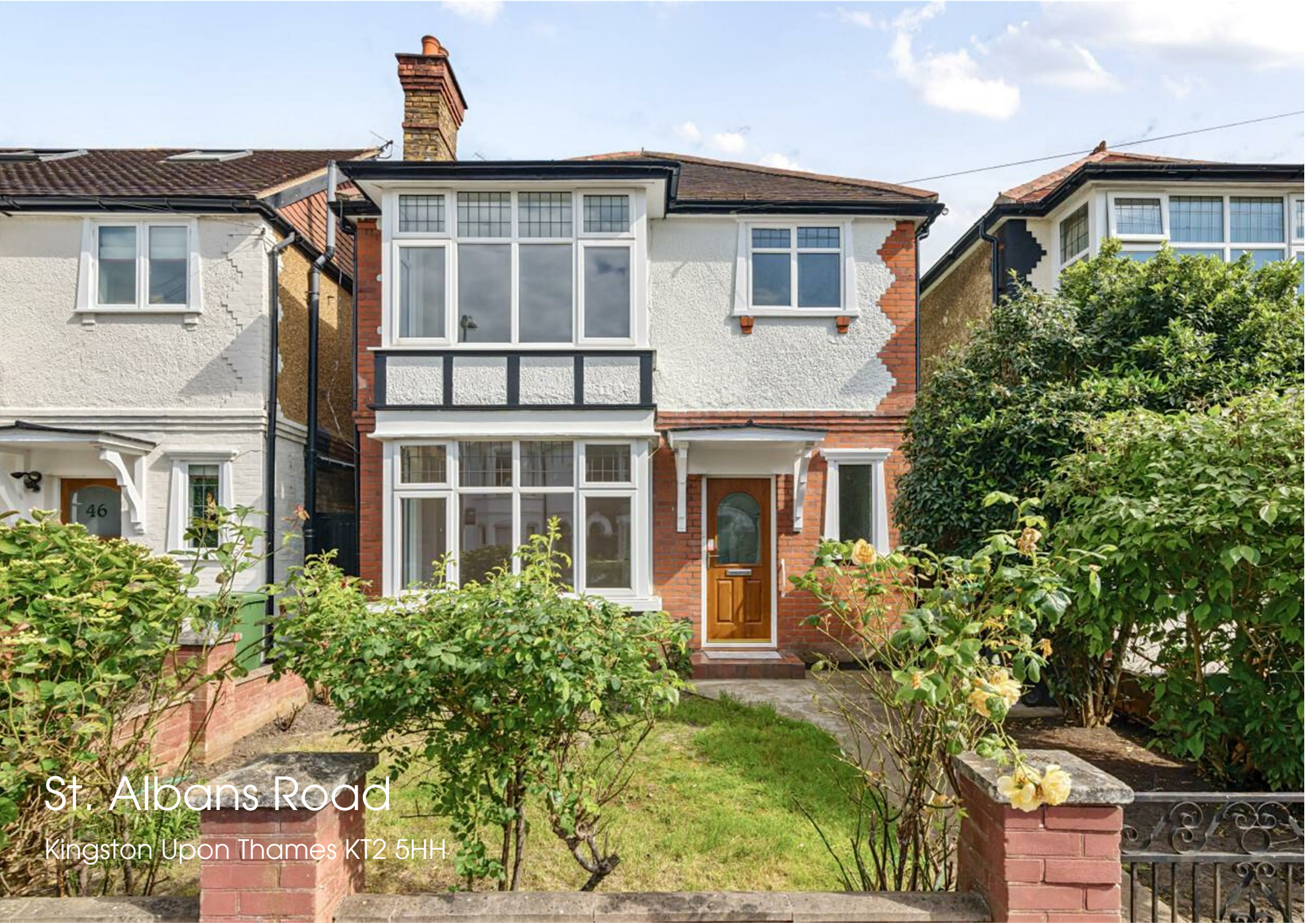
St. Albans Road Kingston Upon Thames KT2 5HH